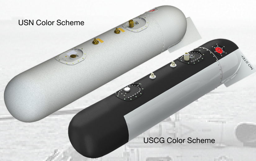
USCG Color Scheme